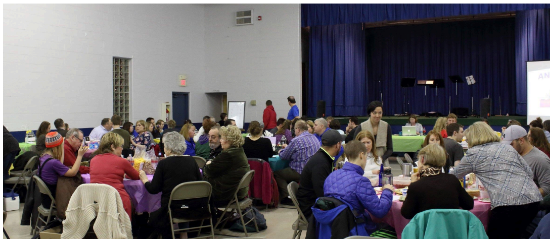
PHOTO GALLERY - 8 th Annual Trivia Night